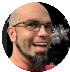
Black Belt Leadership Academy